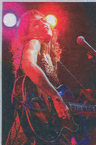
Startling Joan as Policewoman

MEN Arena, Manchester (0844 847 8000), Wed; Edinburgh Castle Edinburgh (0871 220 0260), Thurs