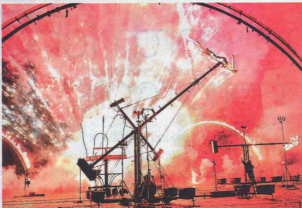
Blink and you'll miss it 'Blink Margate' is a one-off theatre, music and dance spectacle on the seafront